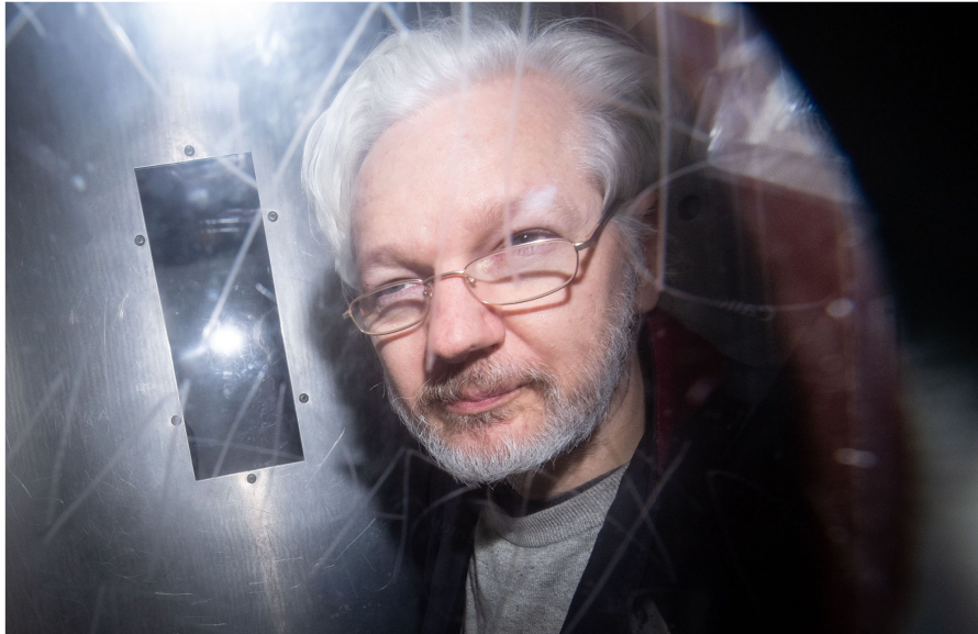
Fifty weeks in prison for violating his bail: Julian Assange in January 2020 in a police van on the way to London's maximum security Belmarsh prison.