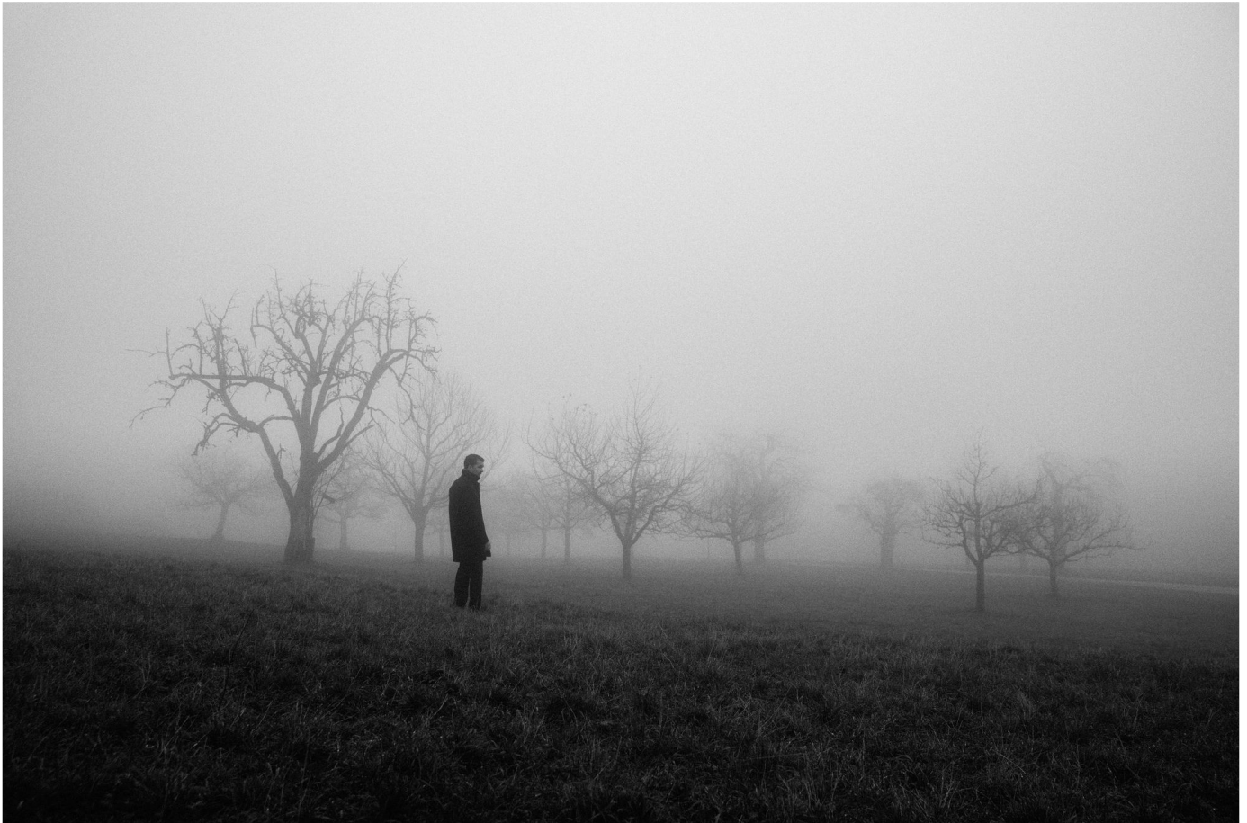
The Swiss Professor of International Law, Nils Melzer, is pictured near Biel, Switzerland.